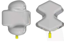
14-16 lb. Core 12, 13 lb. Core