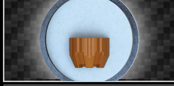
INNER CORE: HOLLOW POINT™