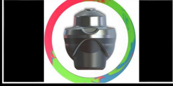
INNER CORE: Overload

More Info: www.motivbowling.com Flip Cards: bowlingdisplays.com