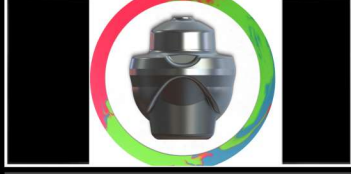
INNER CORE: Overload