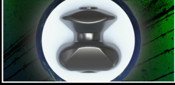
INNER CORE: SINISTER™

OUT OF THE BOX CHARACTERISTICS: The Cruel Intent™ is a dominating power pearl for heavy oil. It is the cleanest and most angular asymmetric ball MOTIV™ has ever produced. More Info: www.motivbowling.com Flip Cards: bowlingdisplays.com