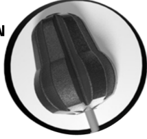
NEW MARAUDER CORE