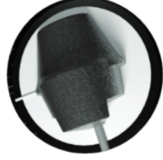
Grudge Low RG Asymmetric