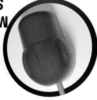
Deviant Medium RG Symmetric