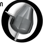
NIRVANA Ultra Low RG