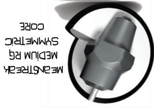
MEANSTREAK MEDIUM RG SYMMETRIC CORE