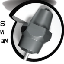
MEANSTREAK MEDIUM RG SYMMETRIC CORE